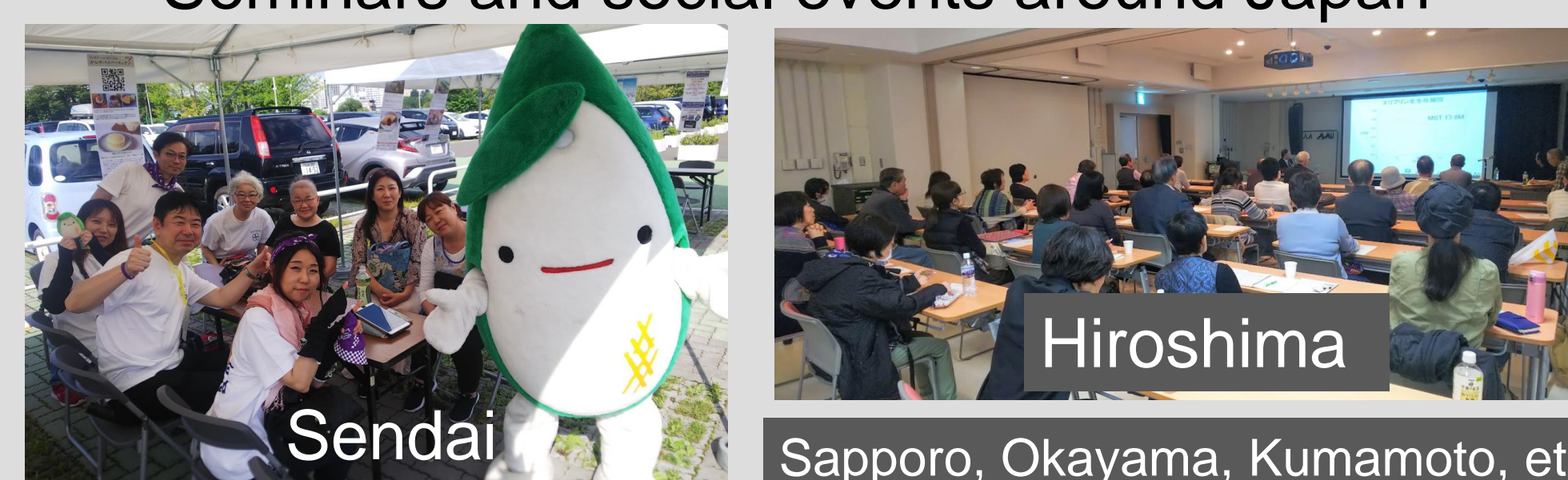
Sendai Sapporo, Okayama, Kumamoto, etc.