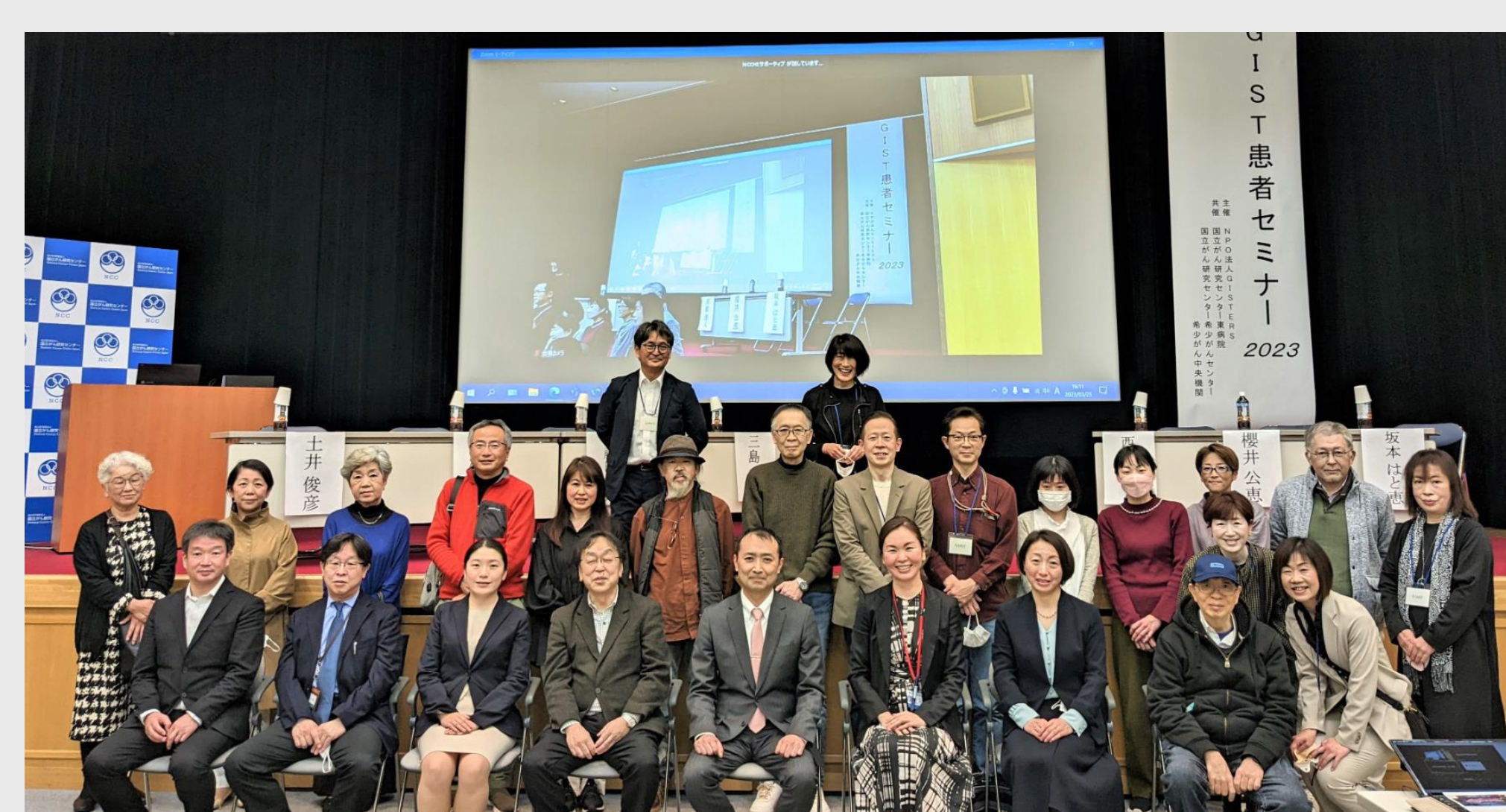
Figure 1. GIST Patient Seminar 2023