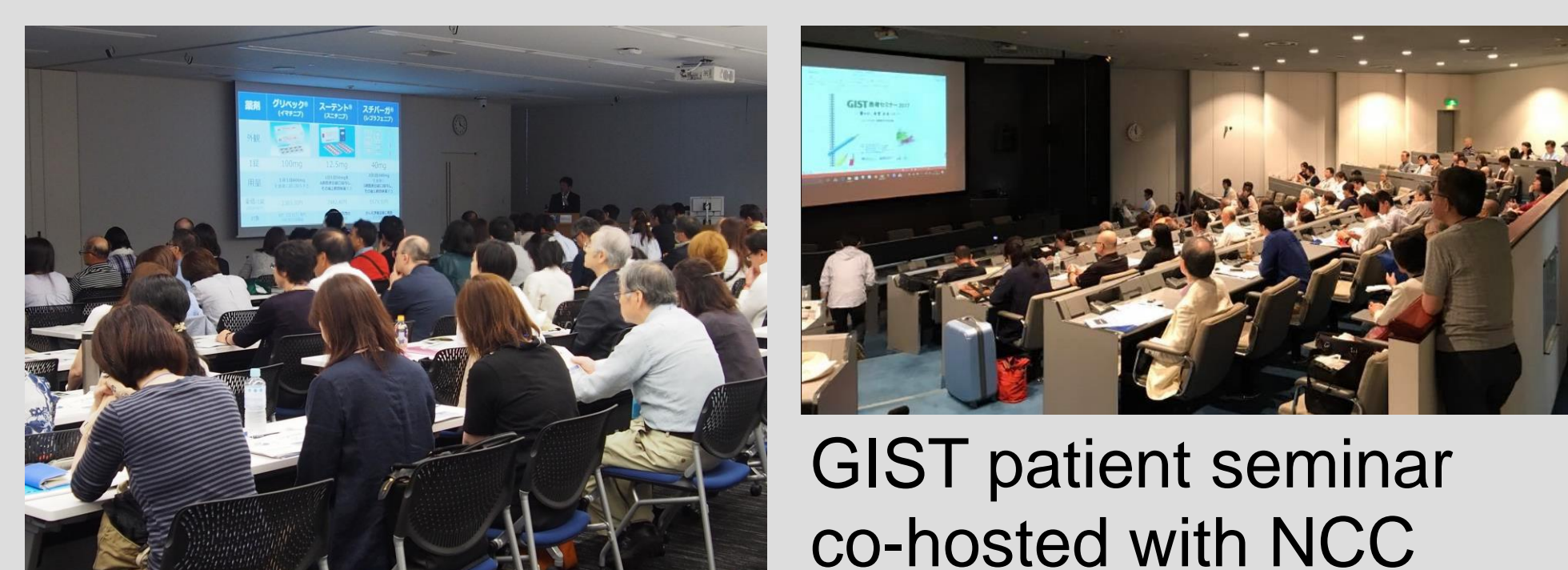
GIST patient seminar co-hosted with NCC