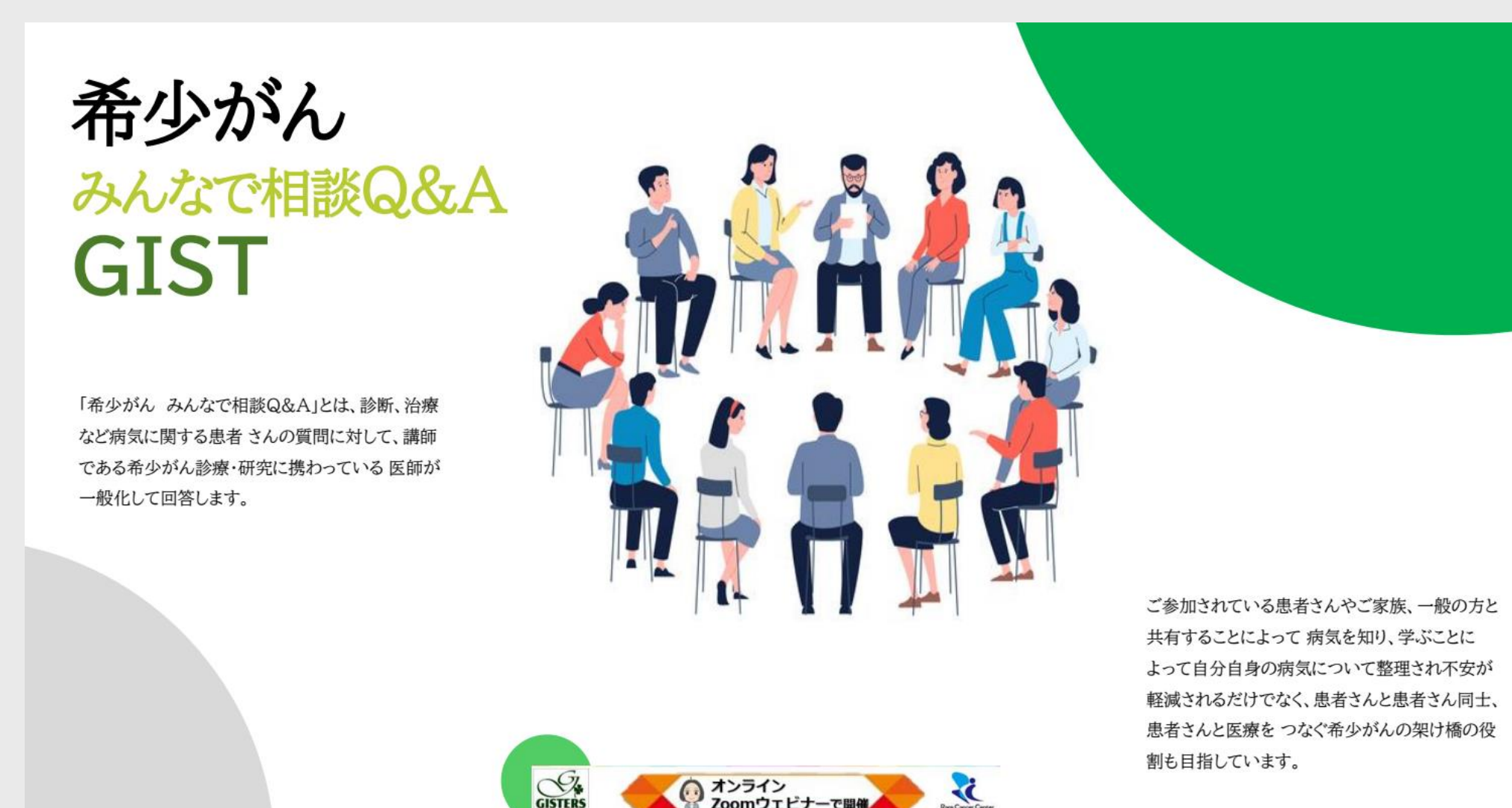
Figure 2. Consultation Q&A with Everyone_GIST Webinar