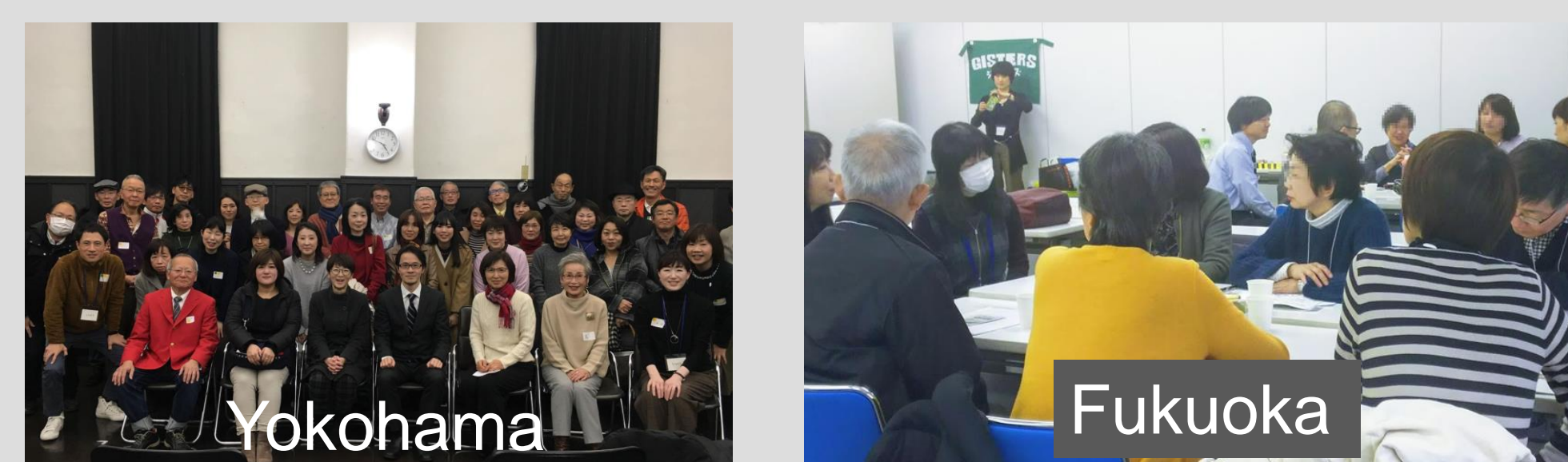
Yokohama Fukuoka Seminars and social events around Japan