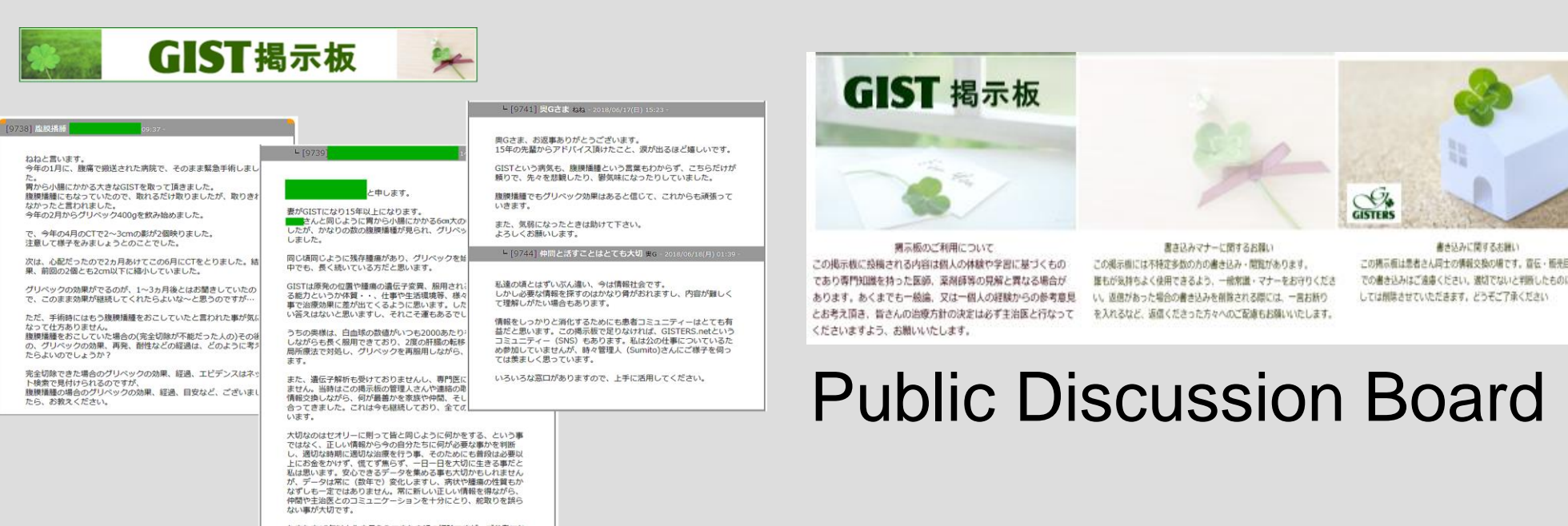
Public Discussion Board