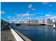
Title: SamuelBeckettBridge Dublin, Ireland.