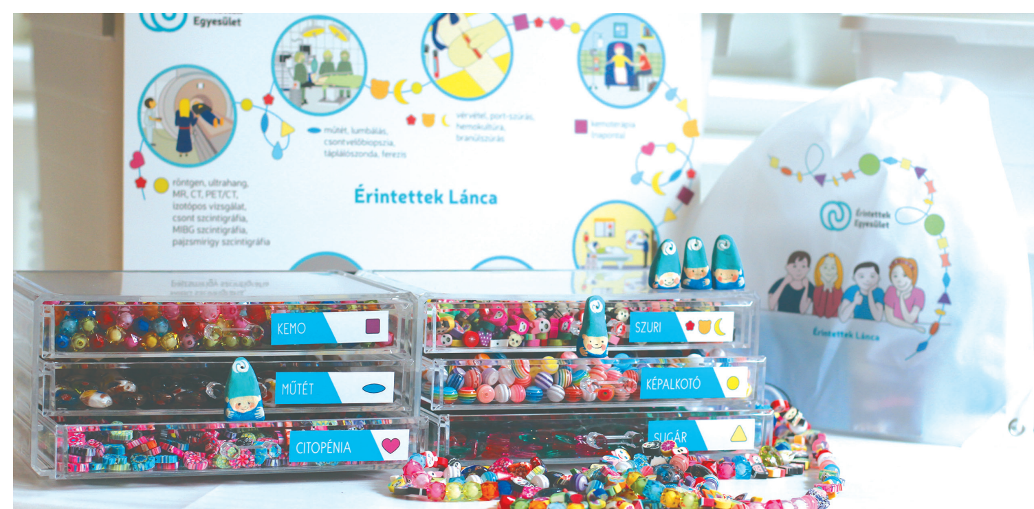
Érintettek necklace – Necklace from the beads received for different stations of the therapy