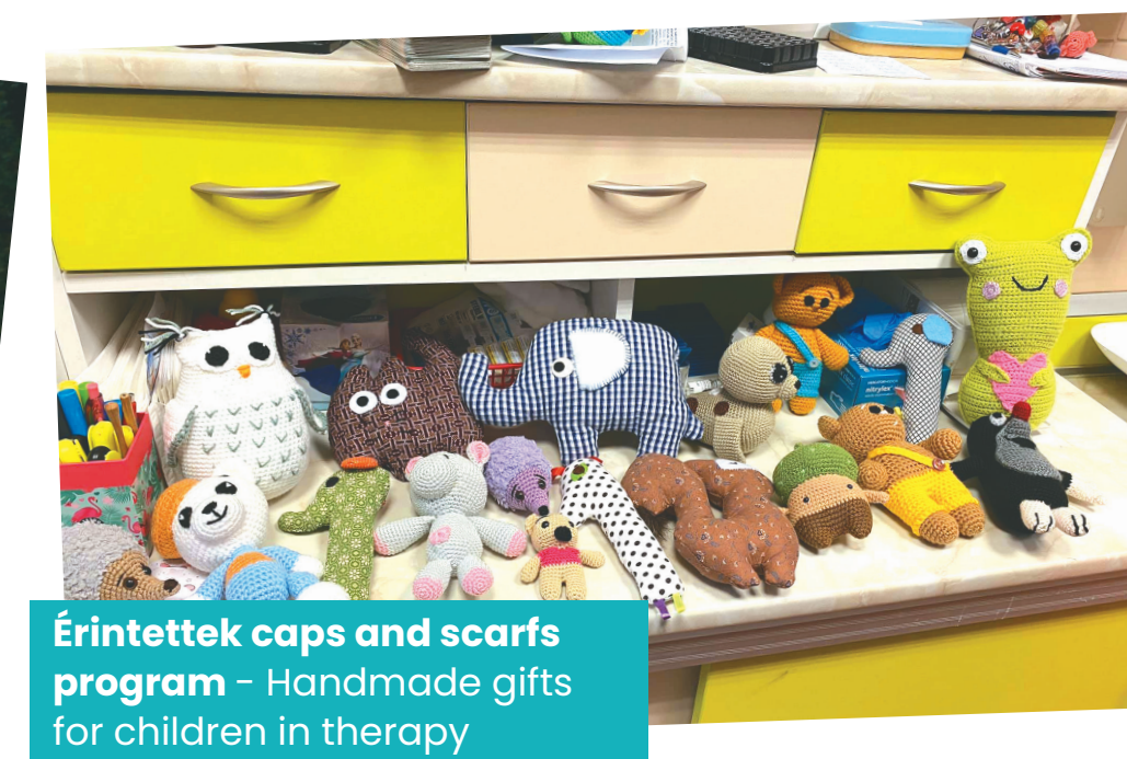
Érintettek caps and scarfs program – Handmade gifts for children in therapy