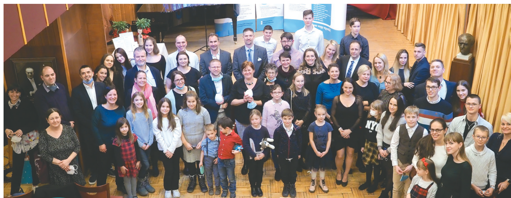
Érintettek award – To show gratitude and recognition of families to the healers

ÉRINTETTEK PODCAST – Personal interviews with doctors, nurses, helpers and survivors