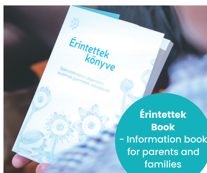
Érintettek Book – Information book for parents and families