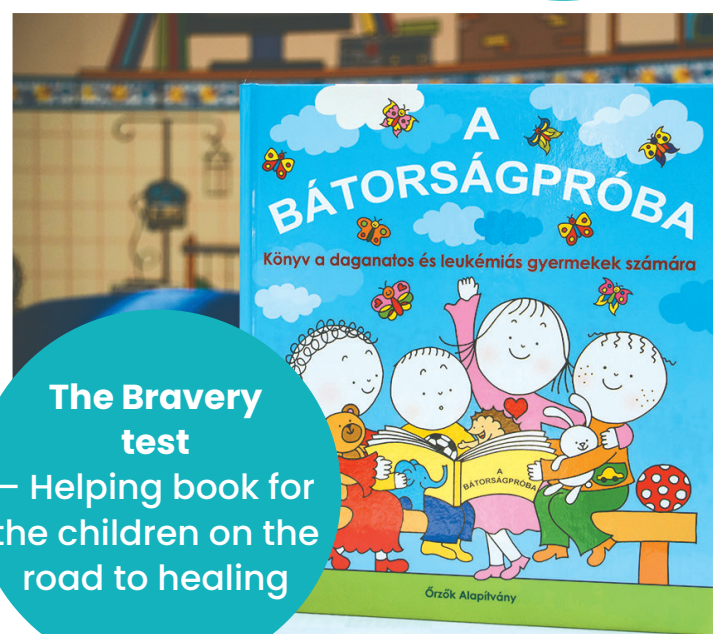
The Bravery test – Helping book for the children on the road to healing