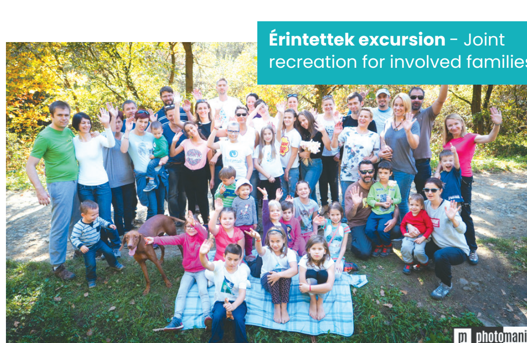
Érintettek excursion – Joint recreation for involved families

unites those in the same fate, we help the lives of families undergoing treatment, those who have recovered, and those who have lost their child.