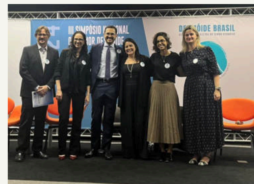
International Symposium Sarcomas and Desmoid Tumor